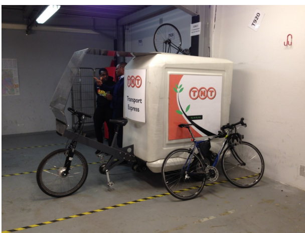
Figure 2. Cargo cycle operated by The Green Link