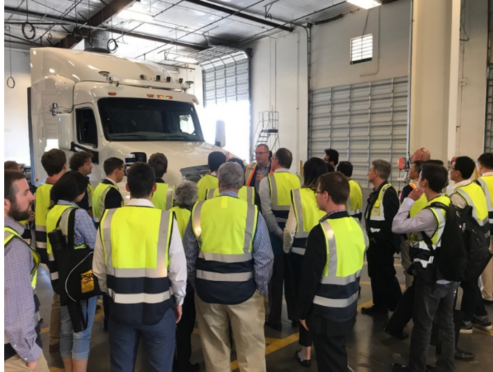
PSR Congress attendees visit technology company TuSimple

Pima Community College hosted the annual PSR Congress, which was held in Tucson, Arizona on April 8-9, 2019. Students, researchers, and administrators from all consortium members were in attendance along with industry and agency representatives from the region. The congress was an opportunity to learn about the transportation challenges and developments in the Tucson area with a focus on workforce development, which is a strength of Pima. The congress began with a reception and speech at the Pima Association of Governments in downtown Tucson on April 8. The congress continued on April 9 with a full day of talks, panels, and research/poster presentations. The day concluded with a site visit to TuSimple, an autonomous trucking technology company. The congress included a meeting of the PSR Advisory Council, which is comprised of leaders of industry and agency organizations throughout the Pacific Southwest Region.