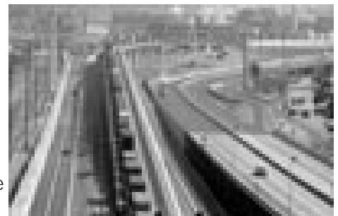
The Alameda Corridor, a 20-mile freight rail expressway, connects the ports of Los Angeles and Long Beach with the transcontinental rail yards near downtown Los Angeles.

The panels concluded that the Alameda Corridor is a model of good governance because it brought together multiple government agencies and the private sector in cooperation to deliver a project that benefits not only the parties involved, but also the entire country, the state and the region as well as individual