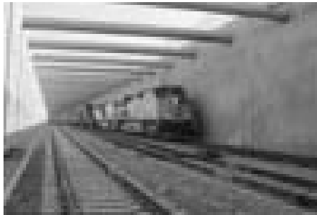
A train travels through the Mid-Corridor-Trench, the ten-mile-long, below ground centerpiece of the Alameda Corridor.