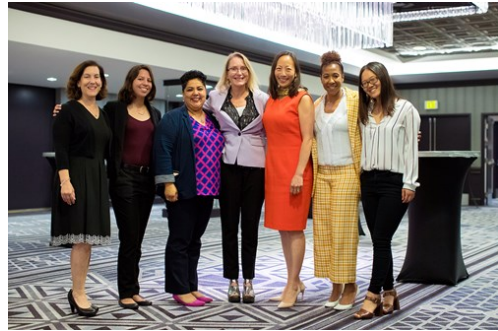
Students among the 5 featured Women in Transportation at WTS-LA's Celebration of Recent Industry Milestones for Women event.