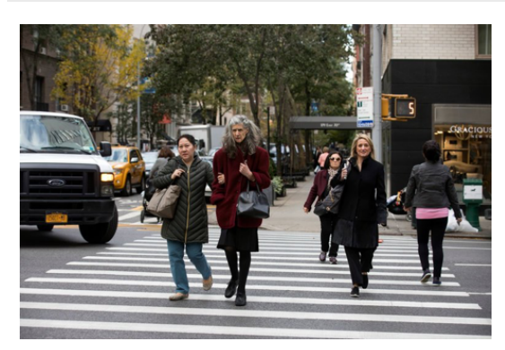
Giving Pedestrians a Head Start Crossing Streets

Financing has become an increasing challenge for California infrastructure, and a group of recent graduates from the University of California, Los Angeles (UCLA) Anderson School of Management and UCLA Luskin School of Public Affairs addressed it in their recent research. Read more <a href="https://example.com/here/bere/be/4/">https://example.com/here/be/4/</a>