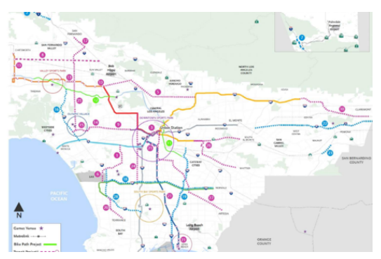
Here are the 28 Projects that Metro Could Complete Before the 2028 Olympics

New York City has expanded the number of intersections where walk signals turn green before the lights do, giving pedestrians a head start. Read more here.