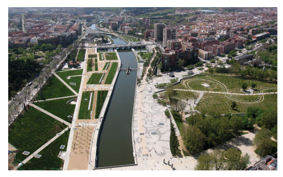
6 Cities That Have Transformed Their Highways Into Urban Parks

On October 5th, WTS-LA hosted a luncheon panel focusing on Senate Bill 1 (SB-1), a legislative package of $54 billion signed into law on April 28, 2017, for maintenance and rehabilitation of California's transportation infrastructure, focusing on safety, congestion, transit, and the improvement of freight mobility throughout the state. Read more here.