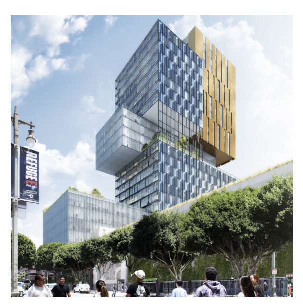
Stacked, Boxy Tower to Rise in the Civic Center

The Chicago-based corporation made one of its first moves in Los Angeles last month by filing plans to redevelop a parking lot near the Los Angeles Times Building as a mixed-use tower. Read more here.