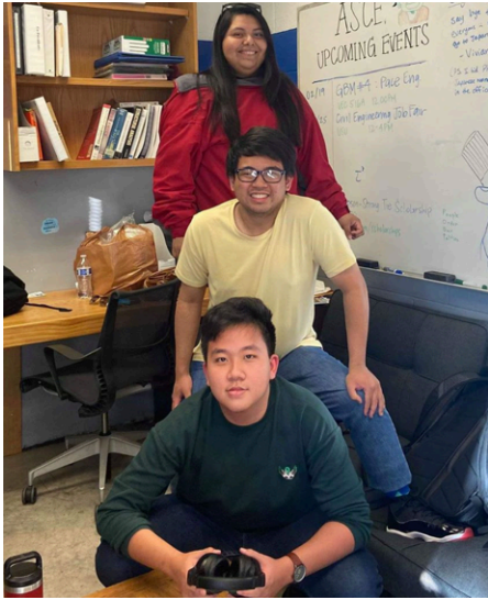
CSULB ITE members showing their engineering pride by wearing the colors of a traffic signal.

Please follow CDC guidelines and local jurisdiction orders, and remember to wash your hands.