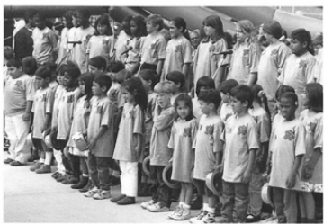
Public Previews Green Line on St. Patrick's Day