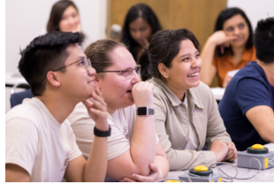
Contestants ponder a question at ITE's 2020 Traffic Bowl.

Remember to wash your hands! Stay safe, all.