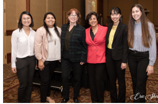
Women in transportation -- students and professionals alike -- at the 2020 CTF Transportation Forum.