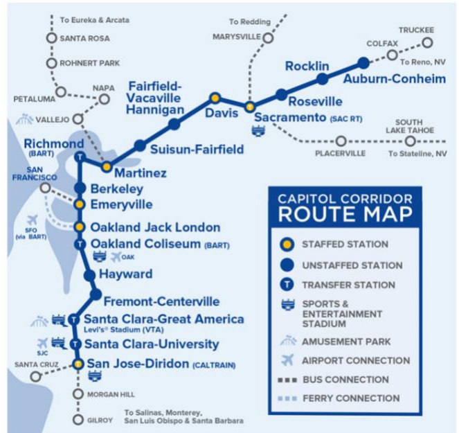
Figure 1. Route of Capitol Corridor

Travel is expected to return to normal. Approximately 80% of respondents reported that once COVID-19 is no longer a threat their usual mode of transportation will be the same mode they indicated as their usual mode for travel in January 2020. However approximately 60% of these same individuals also reported that they would use the ridehail program for commute or non-commute trips.