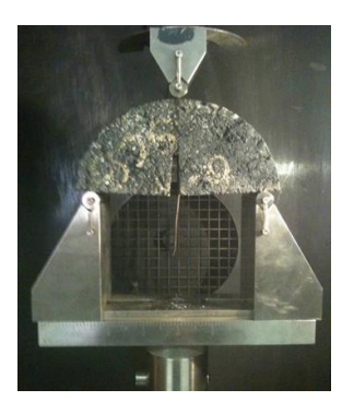
Figure1, SCB test, Cross head Movement Method

In this study, the use of SCB test as QA/QC test to trigger further investigation of the fracture properties of asphalt mixtures using BFT is investigated. To achieve this goal, six different AC mixtures used in California and one from MnROAD are selected. Various asphalt mixtures with various gradation and mixture designs were selected to achieve a comprehensive comparison and evaluation. A total of 42 SCB cross head movement (CHM) method tests and 21 BFTs were conducted on seven asphalt mixtures (PG64-10RAP [LIME], PG64-28PM [LIME], 710P4-AR, AN-HMA, AN-WMA, MnROAD, WMA-ADVERA) that are used in California. In addition 18 SCB camera-method tests were conducted on the same mixtures (with the exception of MnROAD). Figures 1 and 2 show the SCB test Cross-Head Movement and Non-Contact camera Methods.